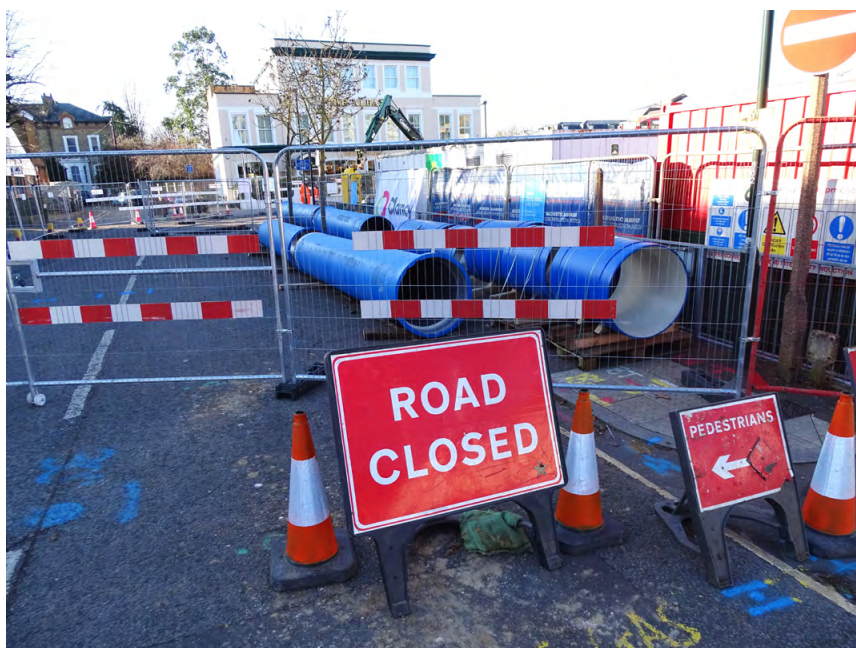
Closed to through Traffic

Thames Water has provided local residents with detailed plans of the work which will take place in three phases running from 5th January to 11th June. For a significant period drivers will not be able to drive past The Albany when turning left or right from London Road. At the same time drivers trying to reach London Road from Station Road will find their way closed. Pedestrian access is not impeded. The work is to divert a main sewer to prepare for the development of Station Yard.