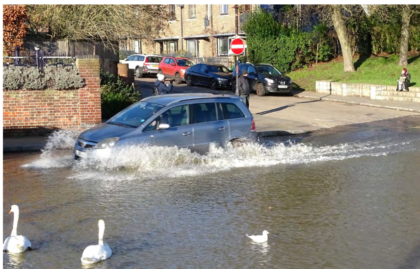
High Tide at the Riverside

Two problems inconvenienced motorists in Twickenham this week. High tides on the Thames at Twickenham riverside caused minor flooding and the sewer works near the station were responsible for delays and diversions. But while the encroaching river water did little except cause a tidal wave and great entertainment for swans, the road closures by the Albany pub have much longer-term implications. Until June the area from Station Road and St. Mary's Terrace will be closed to traffic. This will mean delays for school traffic as well as for drivers taking a back street route to avoid congestion in Heath Road.